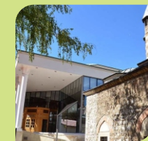
Gazi Husrev-Bey Library (1537)