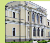
National Museum of B&H (1888)